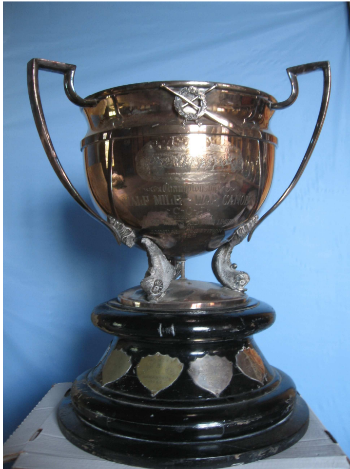
Henry Birks Cup

In 1921 Henry Birks & Sons of Montréal donated the Henry Birks Cup which was awarded to the winner of the half mile race in the Canadian Canoe Association championship. In 1929, after winning the championship on three occasions, ONECC was awarded permanent possession of the cup.