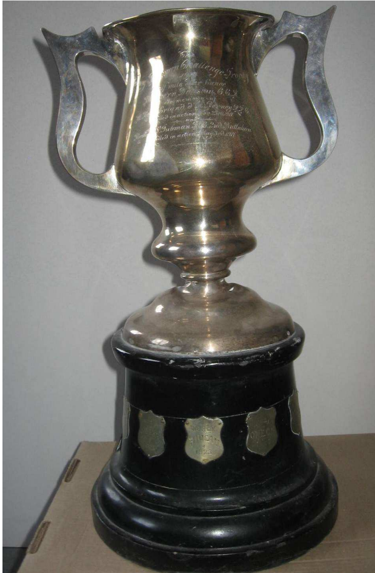
Perney Tubman Challenge Trophy